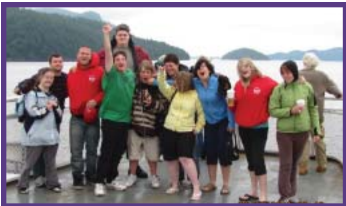
3rd Annual Camp Elphinstone Trip 41 people = Great times